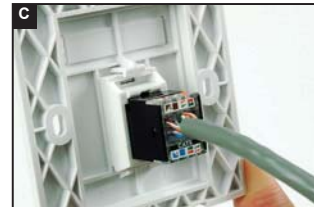
Align the jack to the slot .