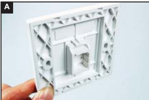
The back of the faceplate.